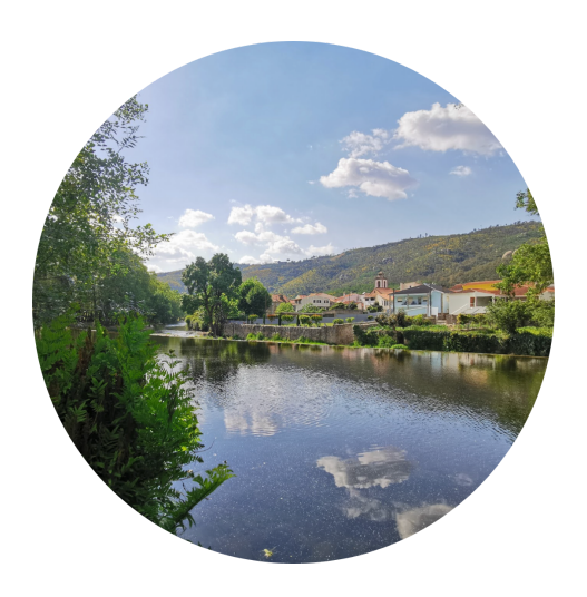
The Role of Creative Industries in the Empowerment of Marginalised Mountain Communities: A Case Study of Aldeias de Montanha, Portugal