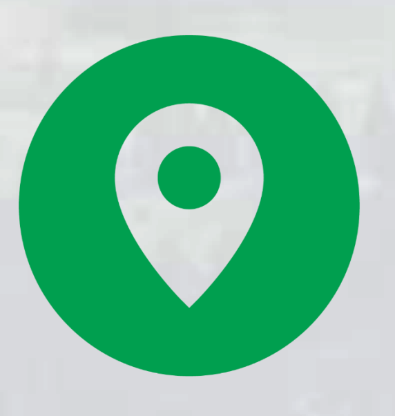
Knowledge synthesis and co-creation with stakeholders