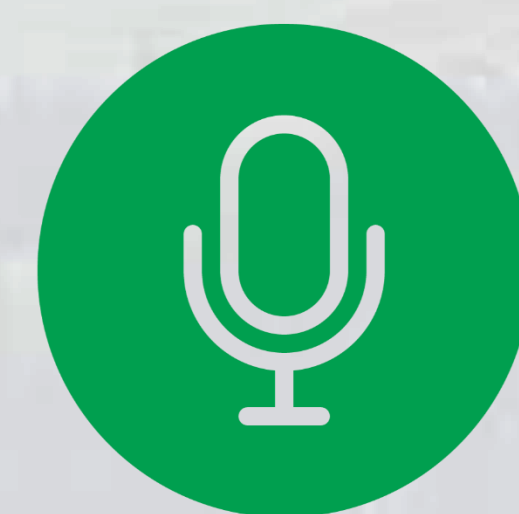
Capacity building and outreach

Together, these working groups apply three innovative concepts on which the Action is based: