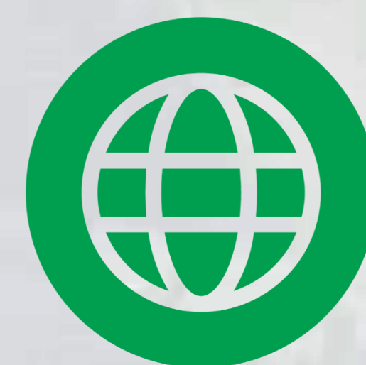
Collaboration and networking

MARGISTAR is organised into three working groups: