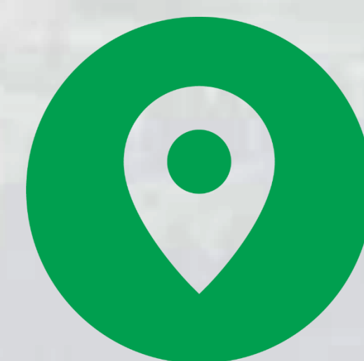
Knowledge synthesis and co-creation with stakeholders